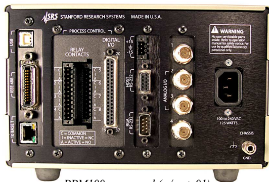
PPM100 rear panel (w/ opt. 01)

An embedded web server connects the PPM100 to the world wide web. The EWS can deliver measurement data to any standard internet browser. Use the EWS to monitor and control your vacuum system or to get automatic email notifications of potential or real system problems.